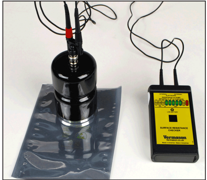
Figure 5. Using the Concentric Ring Probe with the Vermason Surface Resistance Checker