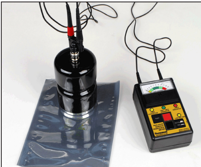
Figure 4. Using the Concentric Ring Probe with the Vermason Analogue Surface Resistance Meter