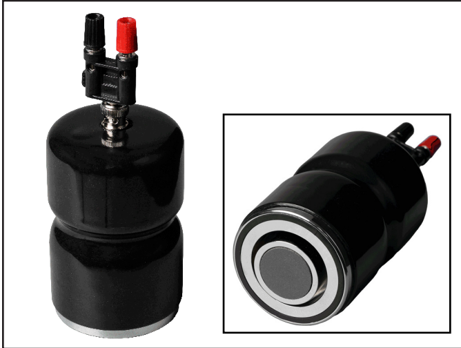
Figure 1. Desco Europe 222002 Concentric Ring Probe