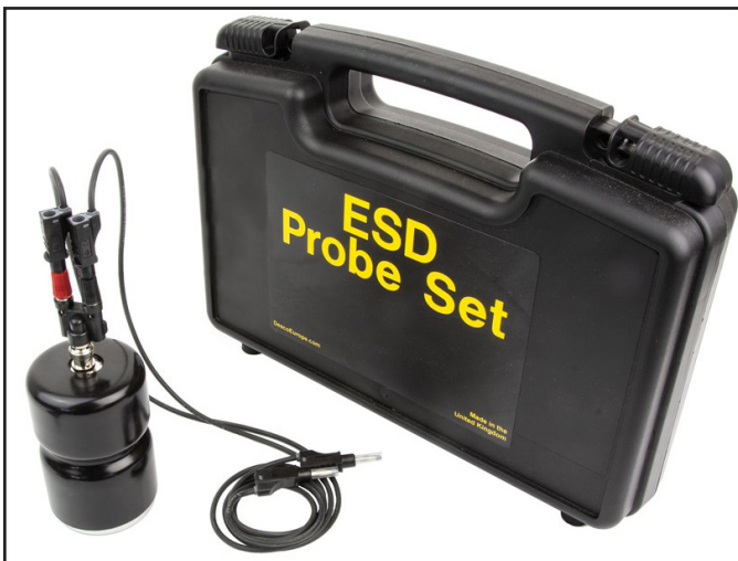
Figure 2. Desco Europe 222003 Concentric Ring Probe Kit