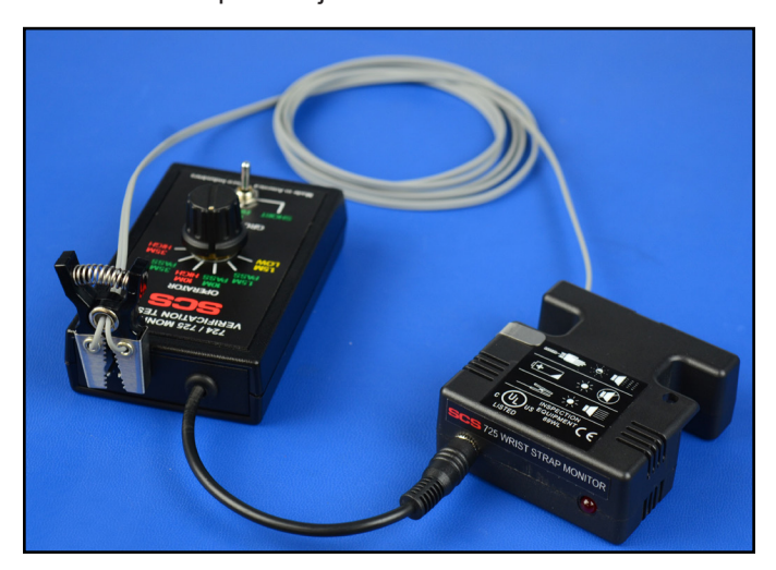
Figure 4. Using the Verification Tester with the 725 Portable Wrist Strap Monitor