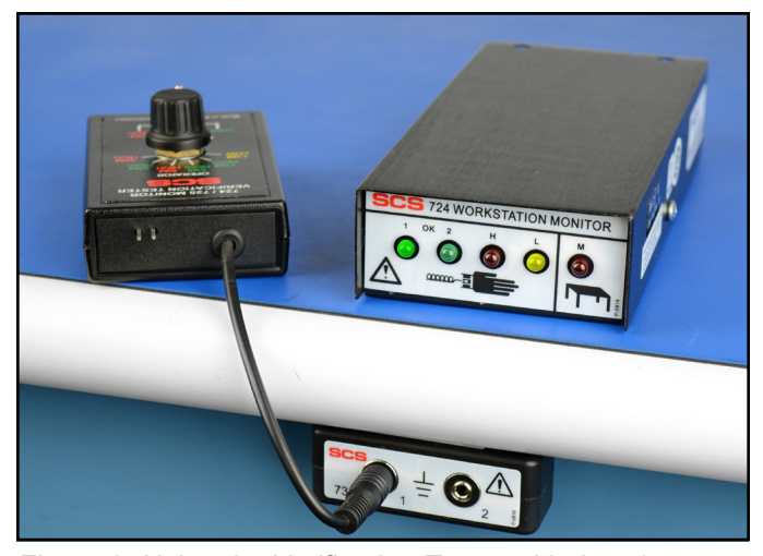
Figure 3. Using the Verification Tester with the 724 Workstation Monitor

1. Insert the Verification Tester's stereo plug into the monitor's operator remote jack #1.